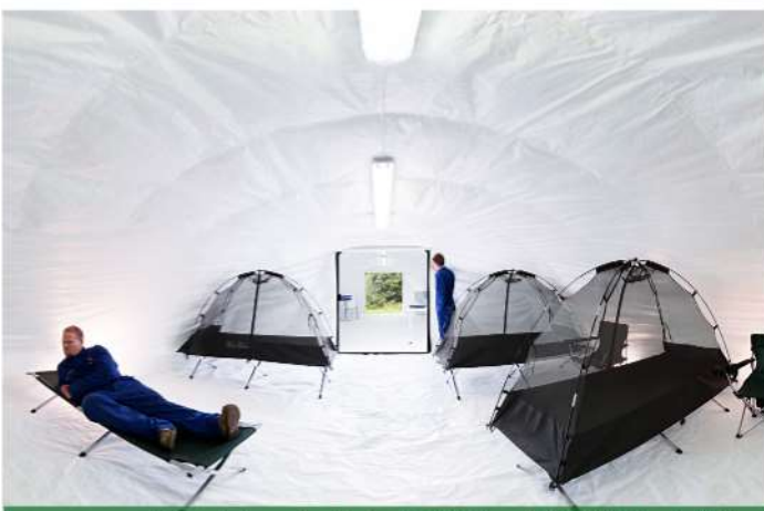
Internal view of a docked CCS25 and CCS50, South Wales

The key to CCS is the use of inflation to create a surface that is optimised for compressive loading. This allows thin walled concrete structures to be formed which are both robust and lightweight. CCS consist of a revolutionary cement based composite fabric (Concrete Canvas) bonded to the outer surface of a plastic inner which forms a Nissen-Hut shaped structure once inflated.