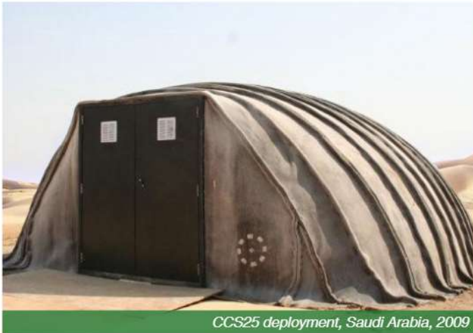
CCS25 deployment, Saudi Arabia, 2009

Financial: CCS have a design life of over 10 years, whereas tents wear out rapidly and must then be replaced. CCS are a one stop solution, saving effort and cost over the lifetime of medium to long term operations.