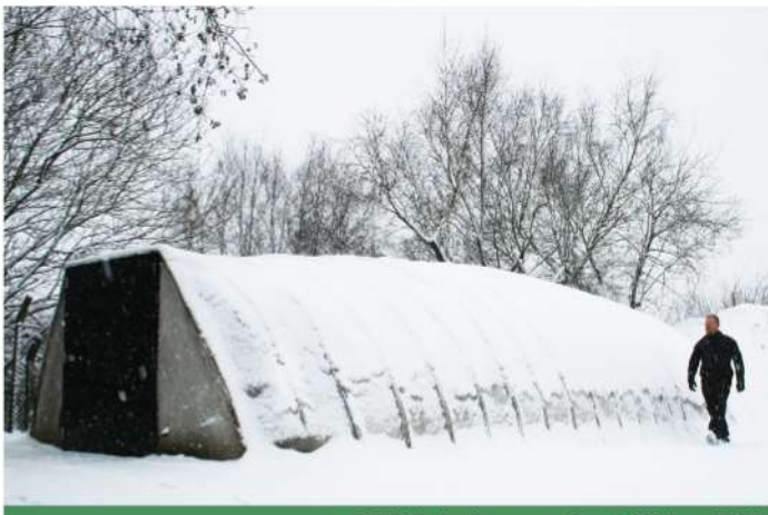
CCS50 deployment, South Wales, 2008